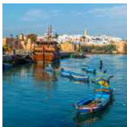
SUNSET RIVER TOUR WITH DINNER