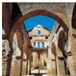
CHELLAH - ROMAN NECROPOLIS VISIT