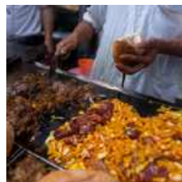
RABAT FOOD TOUR