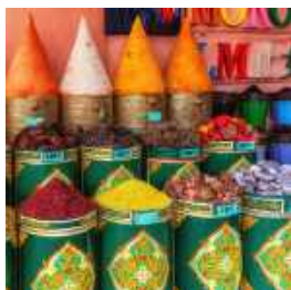
BERBER FARMACY VISIT