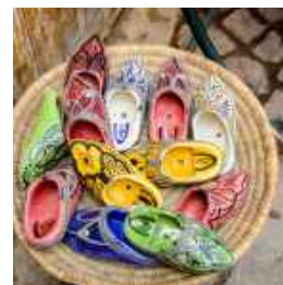
SHOPPING EXPERIENCE AT THE MARRAKECH ZOCO