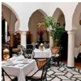
LUNCH OR DINNER AT RICK'S CAFÉ