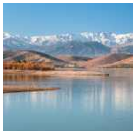
LALLA TAKERKOUT LAKE & ORGANIC FARM LUNCH