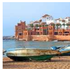
BOUZNIKA & SPA DAY