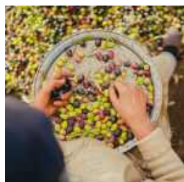
KELAA SRAGHNA TRIP