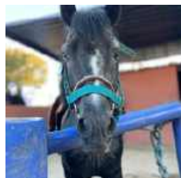
HORSE-BACK RIDING TOUR AROUND SIDI BOUGHABA