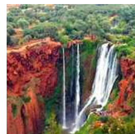
HIKING OURIKA WATERFALLS