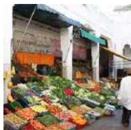
FOOD TOUR AT THE CENTRAL MARKET