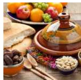
COOKING CLASS IN RABAT