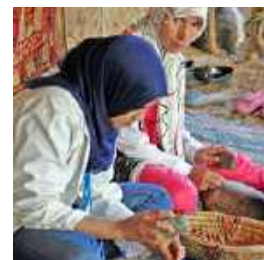
ARGAN FOREST AND CO-OP VISIT