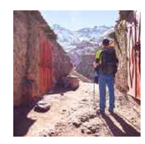
TUBQAL HIKING TOUR