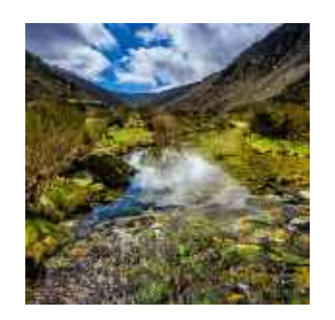
SERRA DA ESTRELA HIKING TOUR