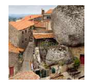
MEDIEVAL VILLAGES TOUR