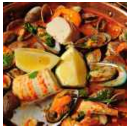
MARKET TOUR & PORTUGUESE COOKING CLASS