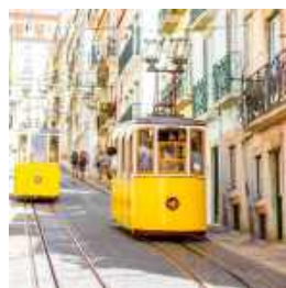
TRAM & FUNICULAR TOUR