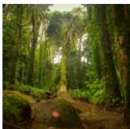
SERRA DA SINTRA HIKING TOUR