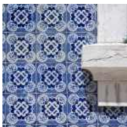
NATIONAL TILE MUSEUM & MOSAIC CLASS