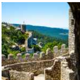
CASTELO DOS MOUROS HIKING TOUR