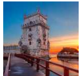
SUNSET BOAT TOUR