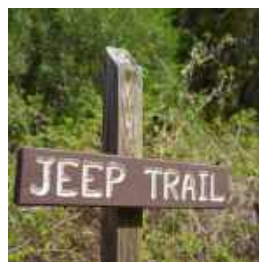
SINTRA 4X4 TOUR