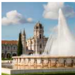
BELEM NEIGHBORHOOD & JERONIMOS MONASTERY