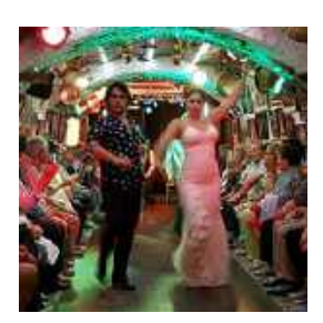
FLAMENCO SHOW & DINNER IN A GYPSY CAVE