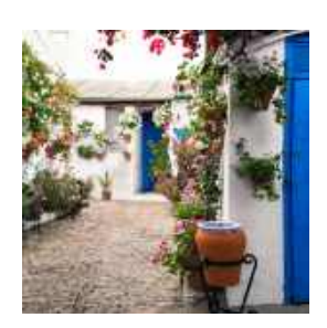
PATIOS OF CORDOBA TOUR