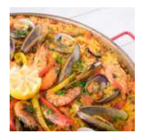
PAELLA & TAPAS COOKING CLASS