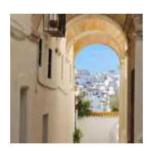
VÉJER & MEDINA SIDONIA TOUR