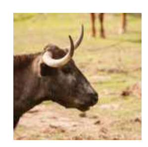
TOROS BRAVOS FARM VISIT