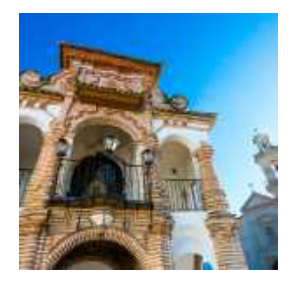
ANTEQUERA & EL TORCAL TOUR