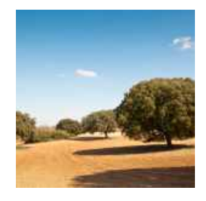
IBERIAN HAM TOUR