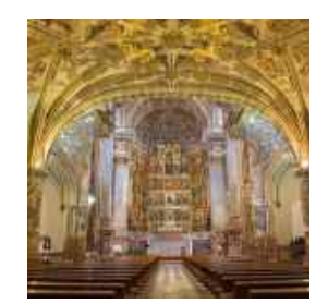
SAN JERÓNIMO MONASTERY & CARTUJA TOUR