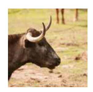
BULL FARM VISIT