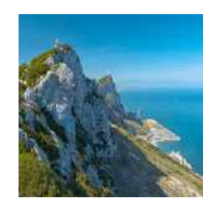
DAY TRIP TO GIBRALTAR