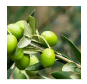
OLIVE OIL TOUR