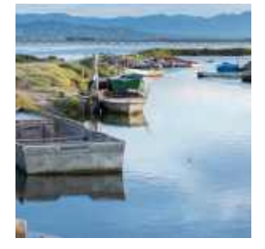
DELTA DE L'EBRE ROUTE, PAELLA & BOAT TRIP