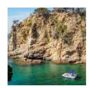
SNORKEL & BOAT TRIP