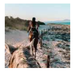
HORSEBACK RIDING ROUTES