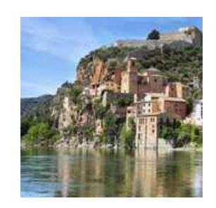
MIRAVET & CASTLE TOUR