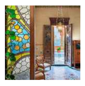
REUS & GAUDI'S BIRTHPLACE