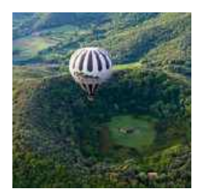
HOT-AIR BALLOON RIDE OVER VOLCANOES