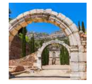
SCALA DEI & MONTSANT TOUR