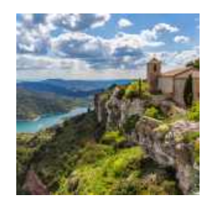
MEDIEVAL TOWNS ROUTE