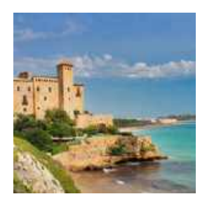
DAURADA COAST ROUTE