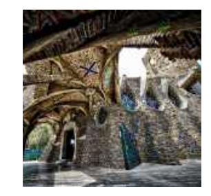
GAUDÍ & GÜELL COLONY