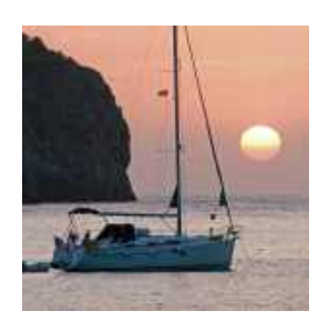
SUNSET & CRUISE TOURS