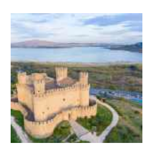
BUITRAGO DE LOZOYA & MANZANARES CASTLE TOUR