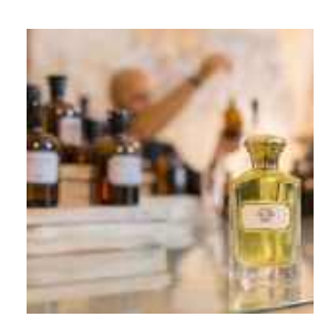
CREATE YOUR OWN PERFUME