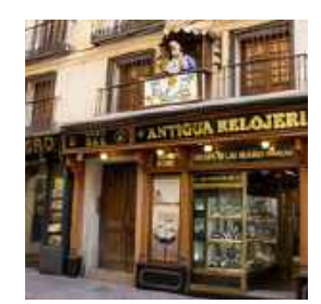
MADRID CULTURAL SHOPPING TRAIL