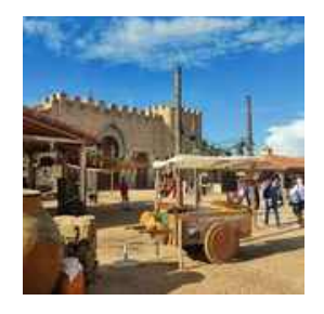
PUY DU FOU SPAIN