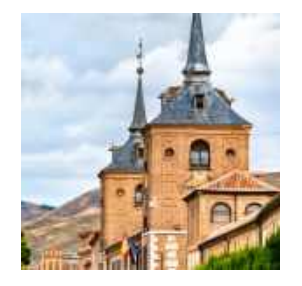
ALCALÁ DE HENARES HALF-DAY TOUR