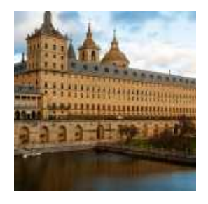
EL ESCORIAL HALF-DAY TOUR